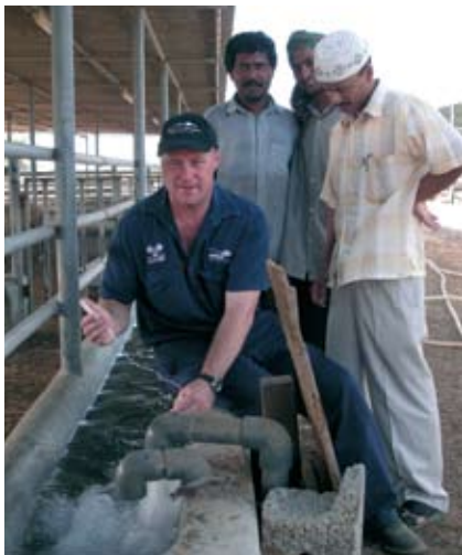
Testing water temperature