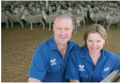
Australian animal welfare experts