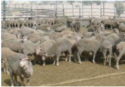
Middle Eastern feedlot